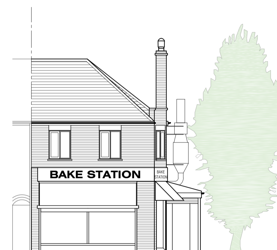
PROPOSED FRONT (WEST-SOUTH) ELEVATION 1:100